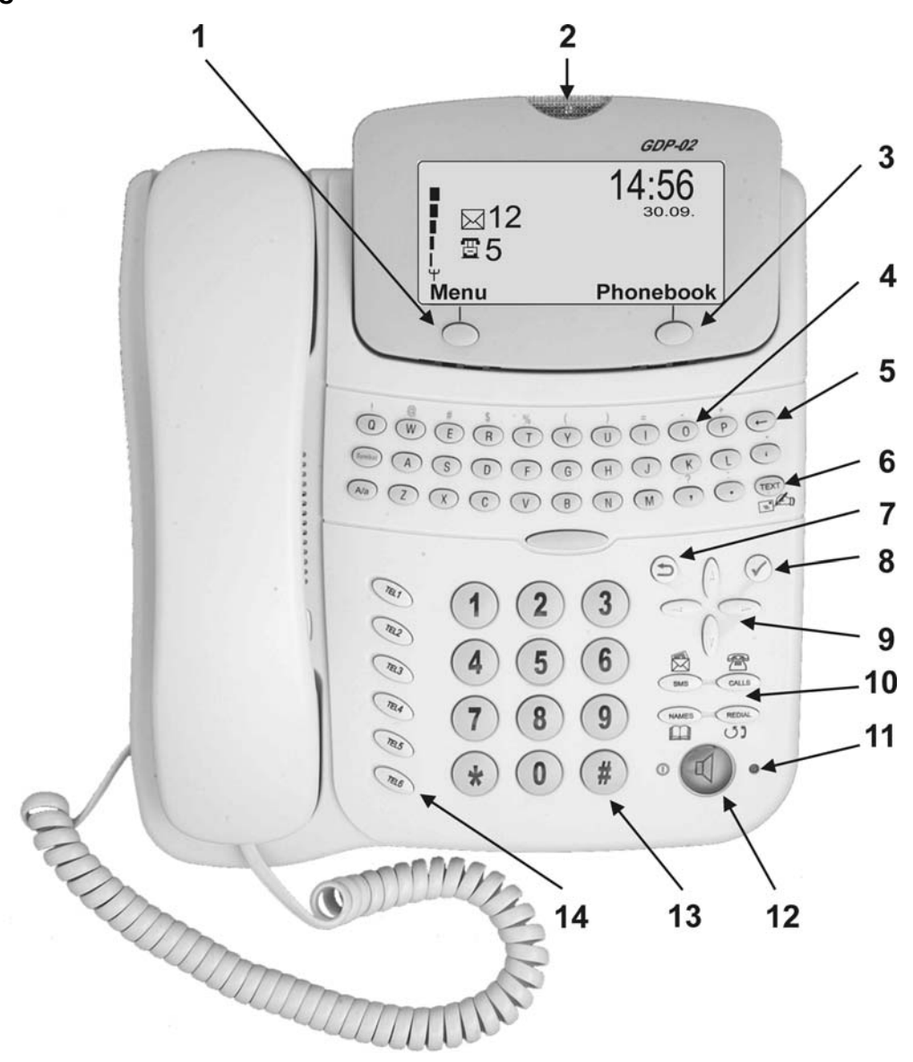
Figure 3: Top View of the Phone